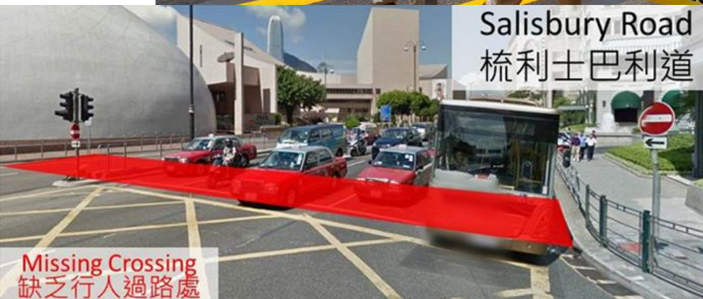
Missing Crossing 缺乏行人過路處