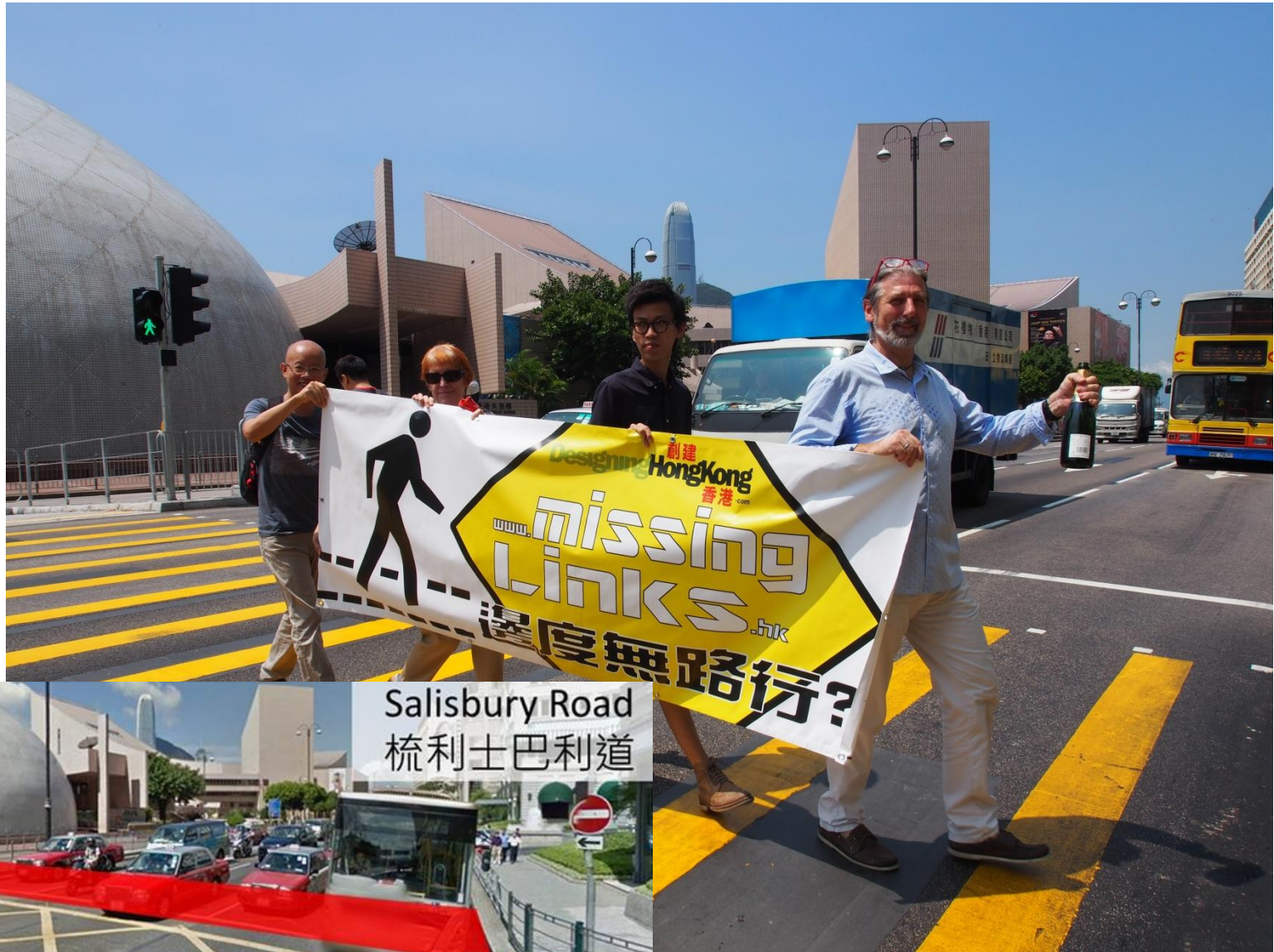
Salisbury Road 梳利士巴利道